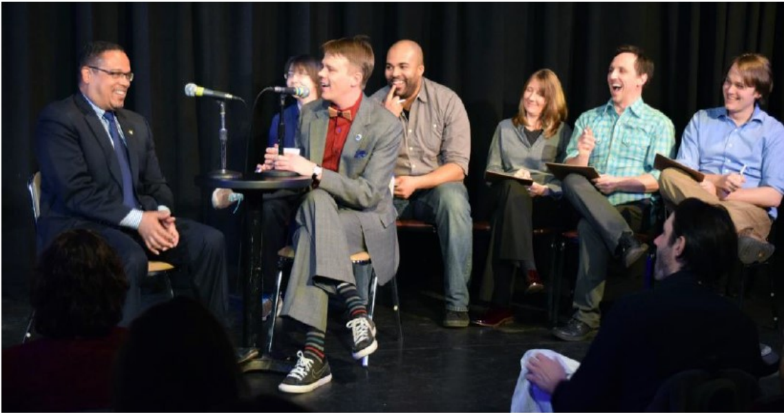
The Theater of Public Policy on stage for a show with Congressman Keith Ellison.

An innovative group is working to get more students at colleges and university students across the country to say “Yes, and...” to speech and debate programs.