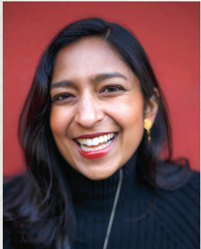
PRIYA KRISHNA CHEF AND FOOD WRITER