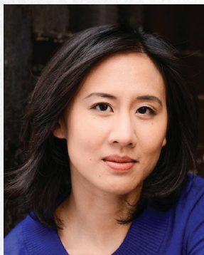
CELESTE NG AUTHOR

Shaker Heights High School CLASS OF 1998