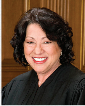
JUSTICE SONIA SOTOMAYOR SUPREME COURT JUSTICE

Shawnee Mission West High School CLASS OF 1987