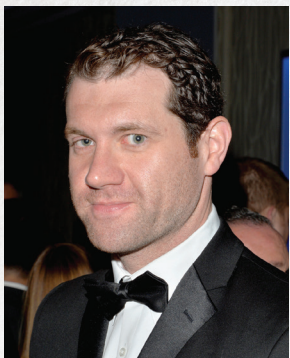
BILLY EICHNER ACTOR

Northwest Classen High School CLASS OF 1966