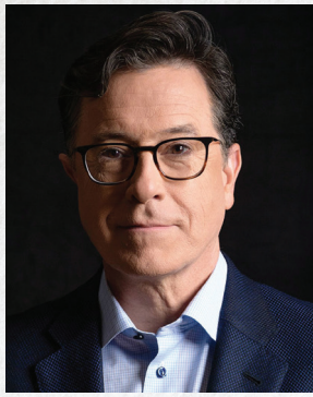
STEPHEN COLBERT COMEDIAN

East Nashville High School CLASS OF 1971