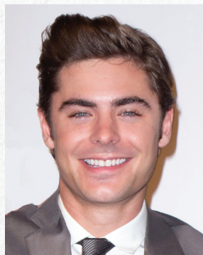
ZAC EFRON ACTOR

Shaker Heights High School CLASS OF 1998