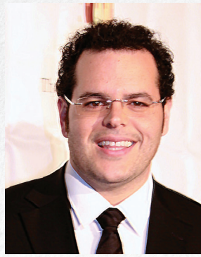
JOSH GAD ACTOR