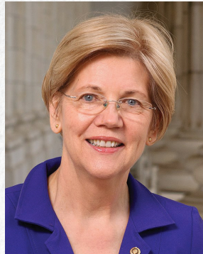
ELIZABETH WARREN POLITICIAN

Northwest Classen High School CLASS OF 1966