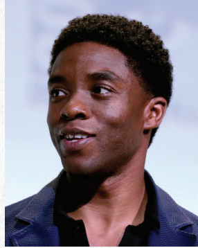
CHADWICK BOSEMAN ACTOR

Cardinal Spellman High School CLASS OF 1972