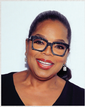
OPRAH WINFREY MEDIA PERSONALITY

East Nashville High School CLASS OF 1971