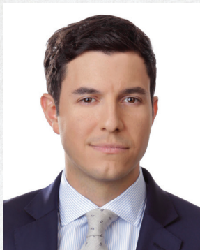
TOM LLAMAS NEWS ANCHOR