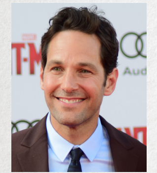
ACTOR Shawnee Mission West High School CLASS OF 1987