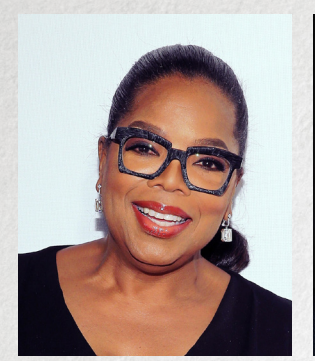
OPRAH WINFREY MEDIA PERSONALITY East Nashville High School CLASS OF 1971