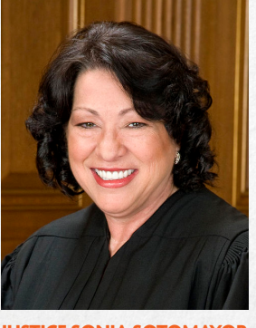
JUSTICE SONIA SOTOMAYOR SUPREME COURT JUSTICE Cardinal Spellman High School