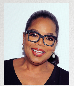
OPRAH WINFREY MEDIA PERSONALITY East Nashville High School