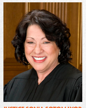
JUSTICE SONIA SOTOMAYOR SUPREME COURT JUSTICE Cardinal Spellman High School