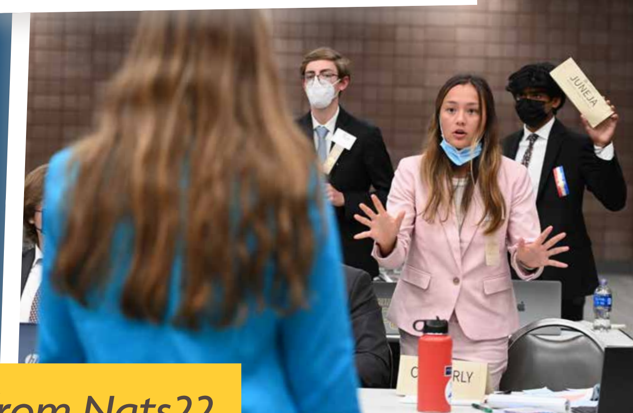
Photos from Nats22