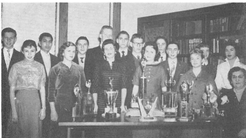
Newton Squad and This Year's Trophies