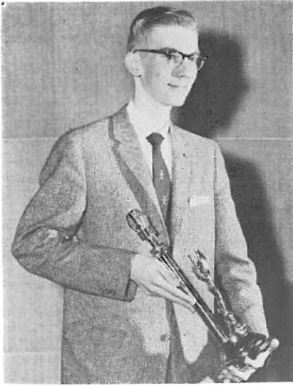
Radio Award to Kenosha