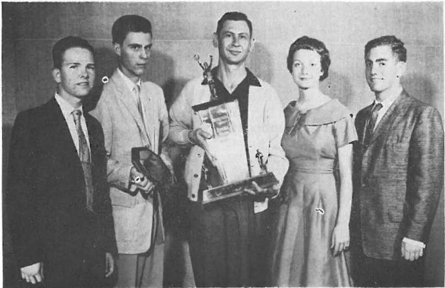
Sweepstakes Champions of 1958 — Bellaire of Houston