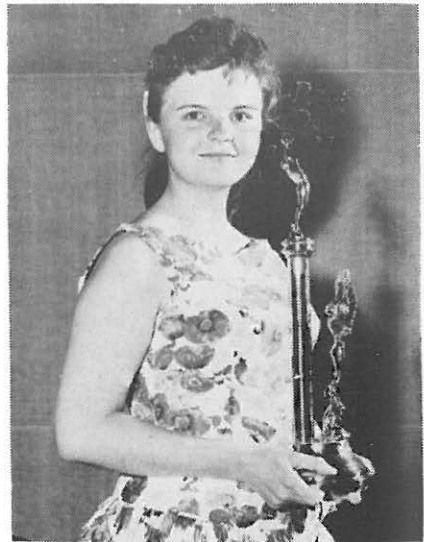
Best in Verse

One of the most important parts of a National Tournament, next to the contests themselves, is the social life during the leisure moments. And the citizenry of Sioux Falls did themselves proud when they planned this year's tournament. There were few if any leis-