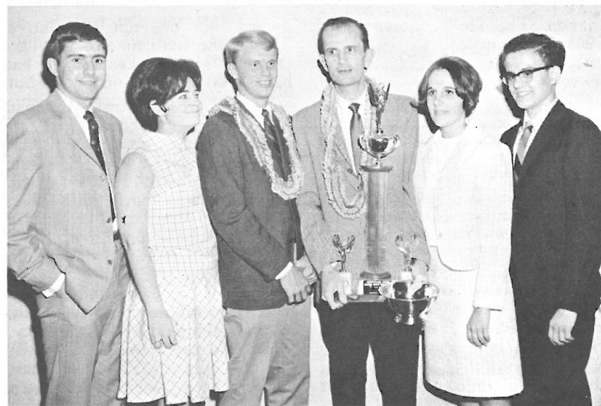
Forty-Six Rounds Win Stakes for Memorial