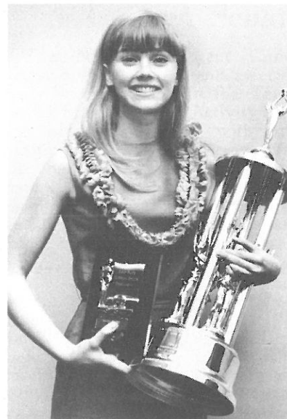
Shelley Long Advocated sex education

Nightmare, and The Limitations of Reason.