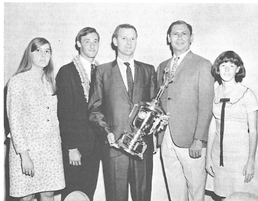
TKA—After Seven Championships in Ten Years